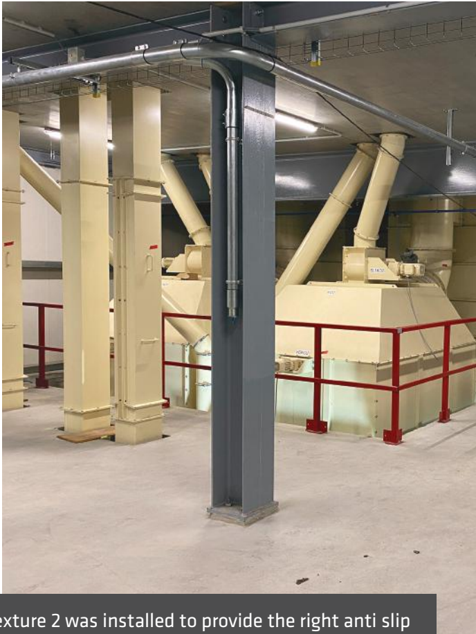
Texture 2 was installed to provide the right anti slip