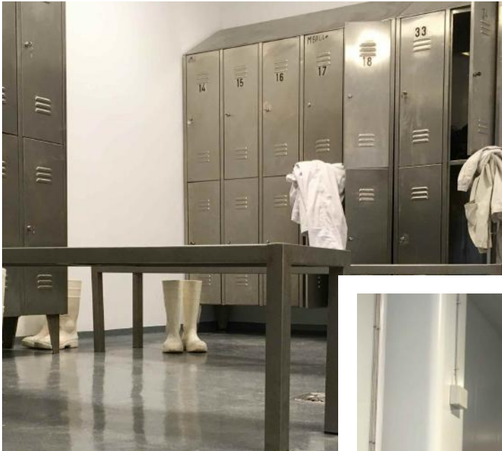
1.650 m 2 Stonhard flooring system